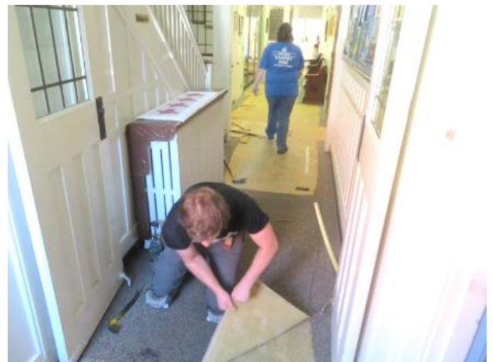
Fike Bros. workers remove the carpeting in the hallway outside the church office.