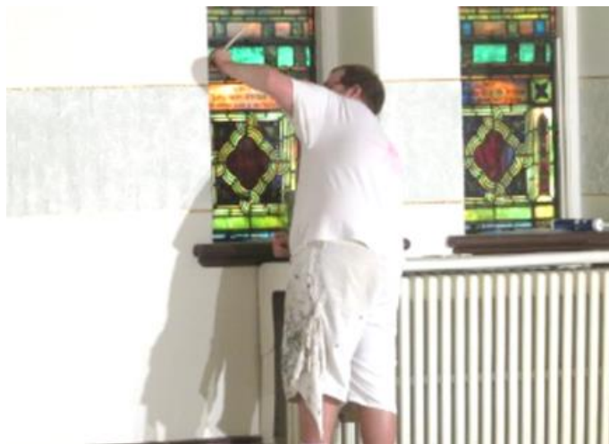
Above, a member of the Waddell painting crew touches up near stained-glass windows. At right, painters work in the south vestibule.

According to the email to the contractors, Williams Construction was to begin building a quiet room and an audio-visual/storage room in the rear of the sanctuary around October 16. Installation of new carpet by Fike Bros. is to begin around November 6. Fike will start with hallways and then do the vestibules and sanctuary.