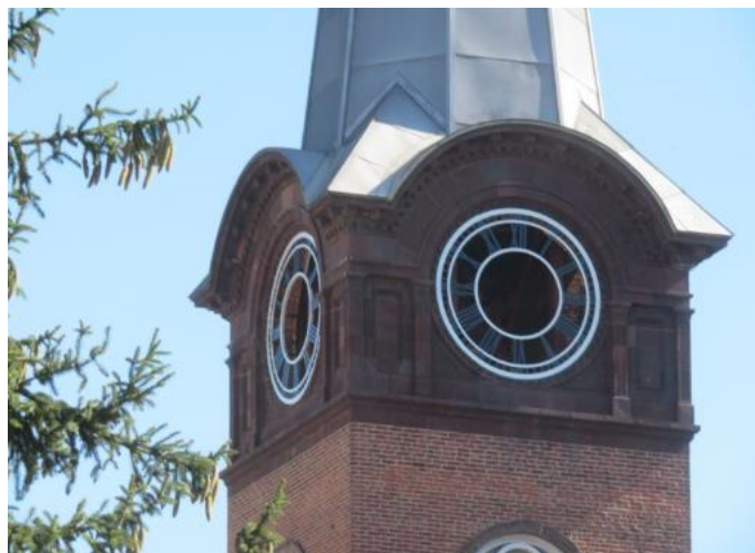
The framework awaits glass and clock hands