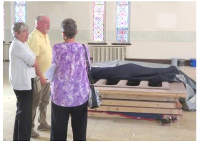
Members of the congregation look at panels to be used in construction of two small rooms.