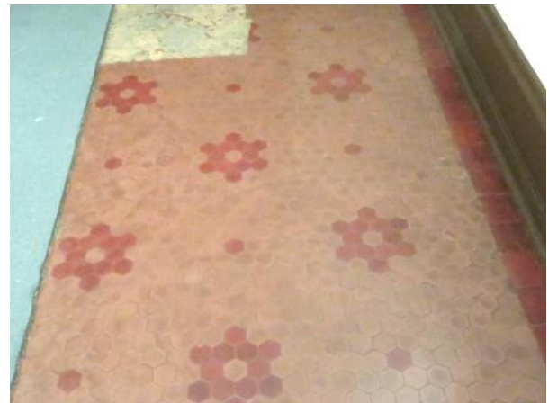
When Sexton Max Byers peeled away worn green carpeting in the clock tower vestibule, he found terracotta tile flooring that may date to the church's construction in 1872.