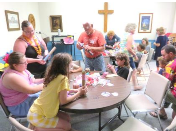
The children craft rain stick noisemakers, above.