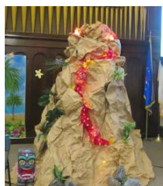
A brown paper volcano rises, at right.