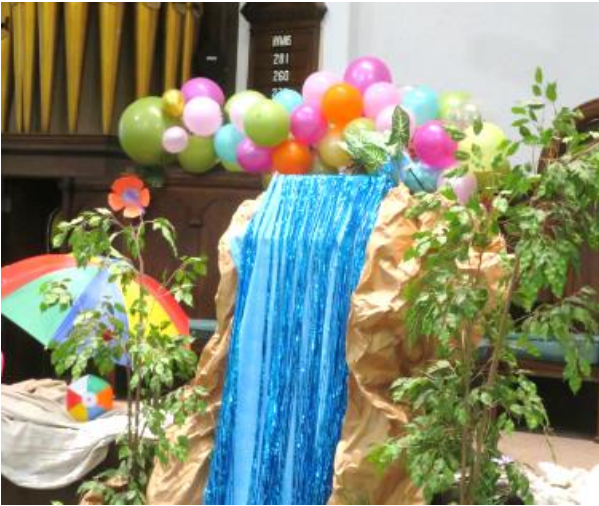
The pulpit was turned into a waterfall.