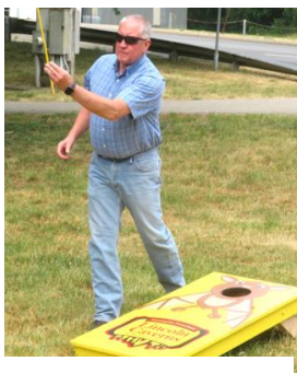
Cornhole at 2023 picnic

T he annual church picnic will be held Sunday, June 16 , at Portstown Park. Again this year, the 10:30 a.m. worship service will be