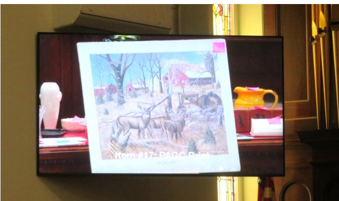
A painting is shown on the big screen.